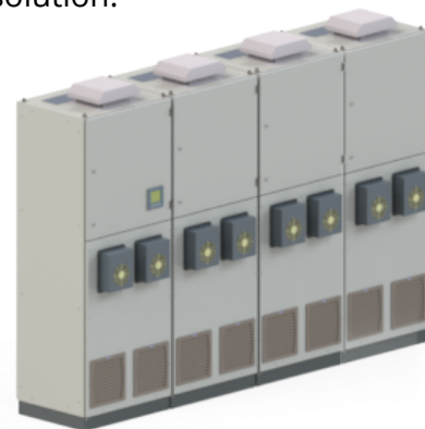
Elspec's 3MVAR Equalizer system

Elspec's agent in Serbia, Avalon Partners, conducted an in-depth power quality investigation and recommended a 3MVAR dynamic reactive power compensation system by Elspec. This system uses ultra-high power thyristor switching technology, providing transient free smooth switching by connecting capacitors at zero-crossing. The system's full acquisition time is less than one cycle. Avalon Partners delivered and commissioned the complete solution.