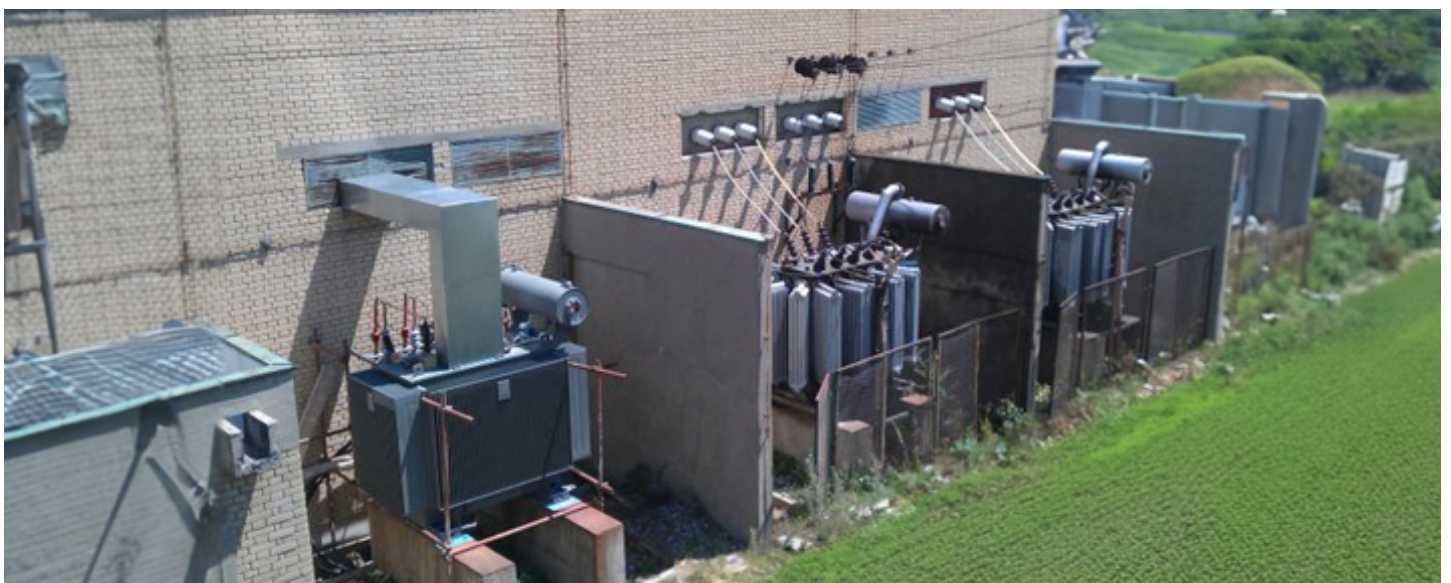
35/0.69kV step-up transformer